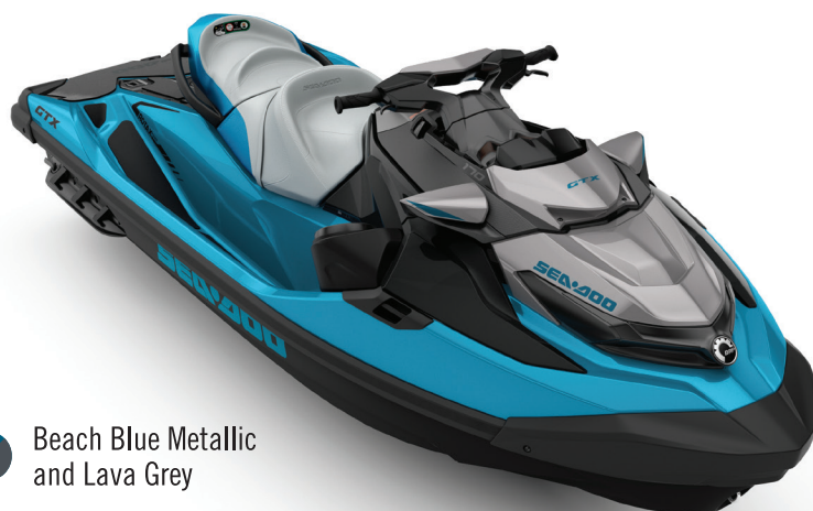
Beach Blue Metallic and Lava Grey