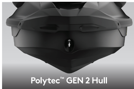
Polytec™ GEN 2 Hull

Exclusive quick-attach system on a large swim platform that allows for easy installation of storage accessories.