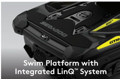
Swim Platform with Integrated LinQ™ System

The industry's first manufacturer-installed, truly waterproof, Bluetooth ® audio system.