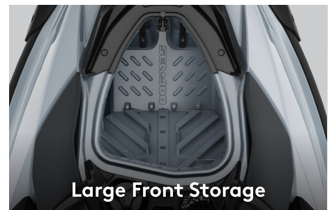
Large Front Storage

Specifically designed to meet the needs of recreational riders, the Polytec GEN 2 material is highly robust and scratch resistant, and reduces overall vehicle weight to improve efficiency.