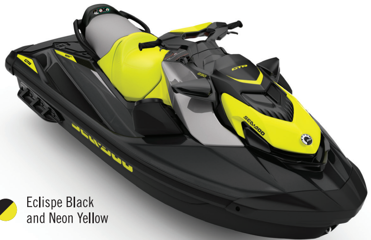
Eclipse Black and Neon Yellow