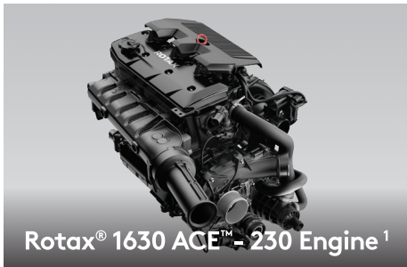
Rotax® 1630 ACE™ - 230 Engine 1

This powerful engine comes standard with a supercharger and external intercooler. It is optimized to run on regular fuel, which lowers fuel costs.