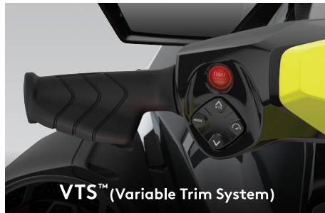
VTS™ (Variable Trim System)

This powerful engine comes standard with a supercharger and external intercooler. It is optimized to run on regular fuel, which lowers fuel costs.