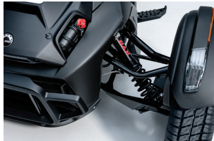
FULL KYB HPG SHOCKS Front and rear KYB HPG shocks with remote adjusters and 1 inch of extra suspension travel to optimize your ride and improve comfort.