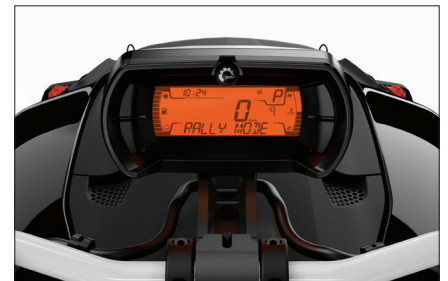
RALLY MODE AND TYRES Allows you to have more flexibility and fun off-pavement by optimizing VSS input and enabling you to perform controlled drifts with adapted all-road tyres.