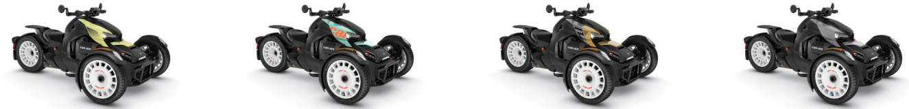
Lemon Twist Icepop Blue Gold Rush Silver Lava