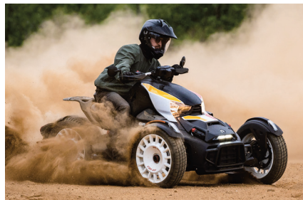
UNIQUE RALLY EXPERIENCE A vehicle designed for all-road trips with hand guards, Rally comfort seat for a more reactive rider position and adjustable large anti-slip foot pegs.