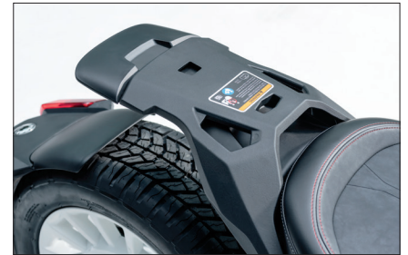
MAX MOUNT STRUCTURE Makes the unit 1+1 ready. It also increases the carrying capacity for different storage options.