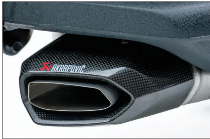
AKRAPOVIČ EXHAUST Unique sound signature and high-end exhaust.