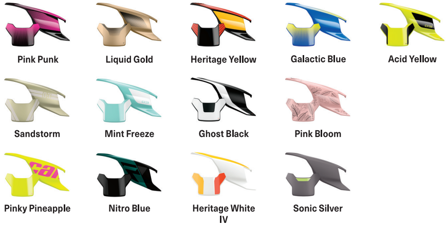
Pink Punk Liquid Gold Heritage Yellow Galactic Blue Acid Yellow Sandstorm Mint Freeze Ghost Black Pink Bloom Pinky Pineapple Nitro Blue Heritage White IV Sonic Silver