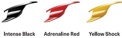
Intense Black Adrenaline Red Yellow Shock